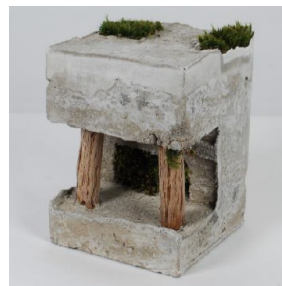
A sculpture against a neutral background